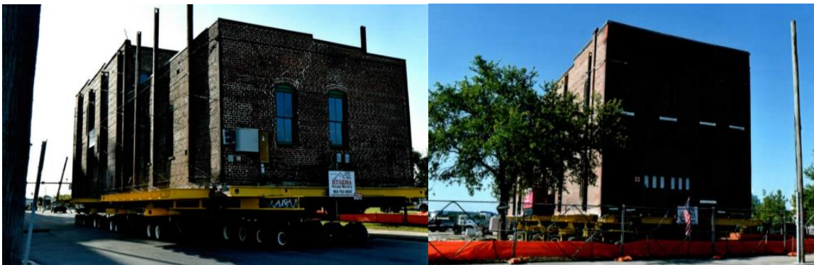
March 26, 2022 – Moving day for the Jax Fire Rescue Museum down Bay Street, towards its new location on Southside of Bay Street of East of the Police Memorial Building. Plans to relocate the Museum from its previous within Metropolitan Park were quickly developed.