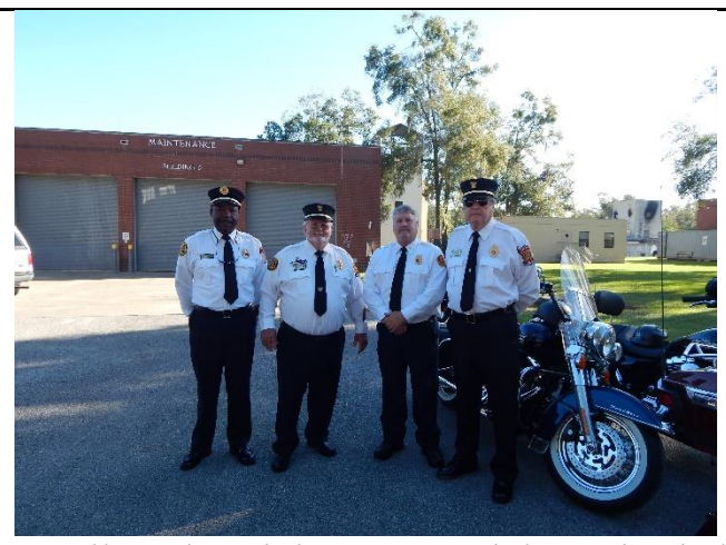
The Annual Sea of Blue March and Jacksonville's Fallen Fire Fighter Memorial Service held at Fire Station # 1 was conducted October 2017.